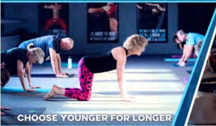
CHOOSE YOUNGER FOR LONGER

TRANSFORM YOUR HEALTH & FITNESS JOURNEY WE'RE MORE THAN JUST A GYM WE'RE YOUR THIRD SPACE!