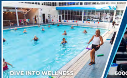
DIVE INTO WELLNESS