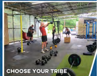
CHOOSE YOUR TRIBE