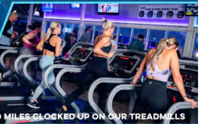
5000 MILES CLOCKED UP ON OUR TREADMILLS