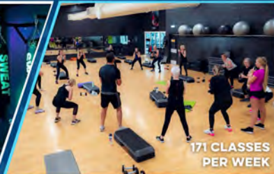
171 CLASSES PER WEEK