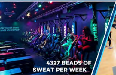
4327 BEADS OF SWEAT PER WEEK