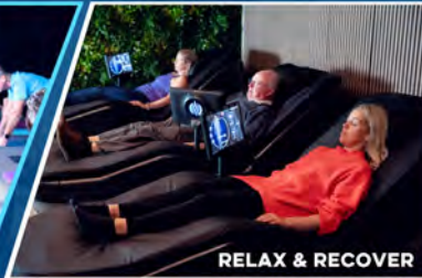
RELAX & RECOVER